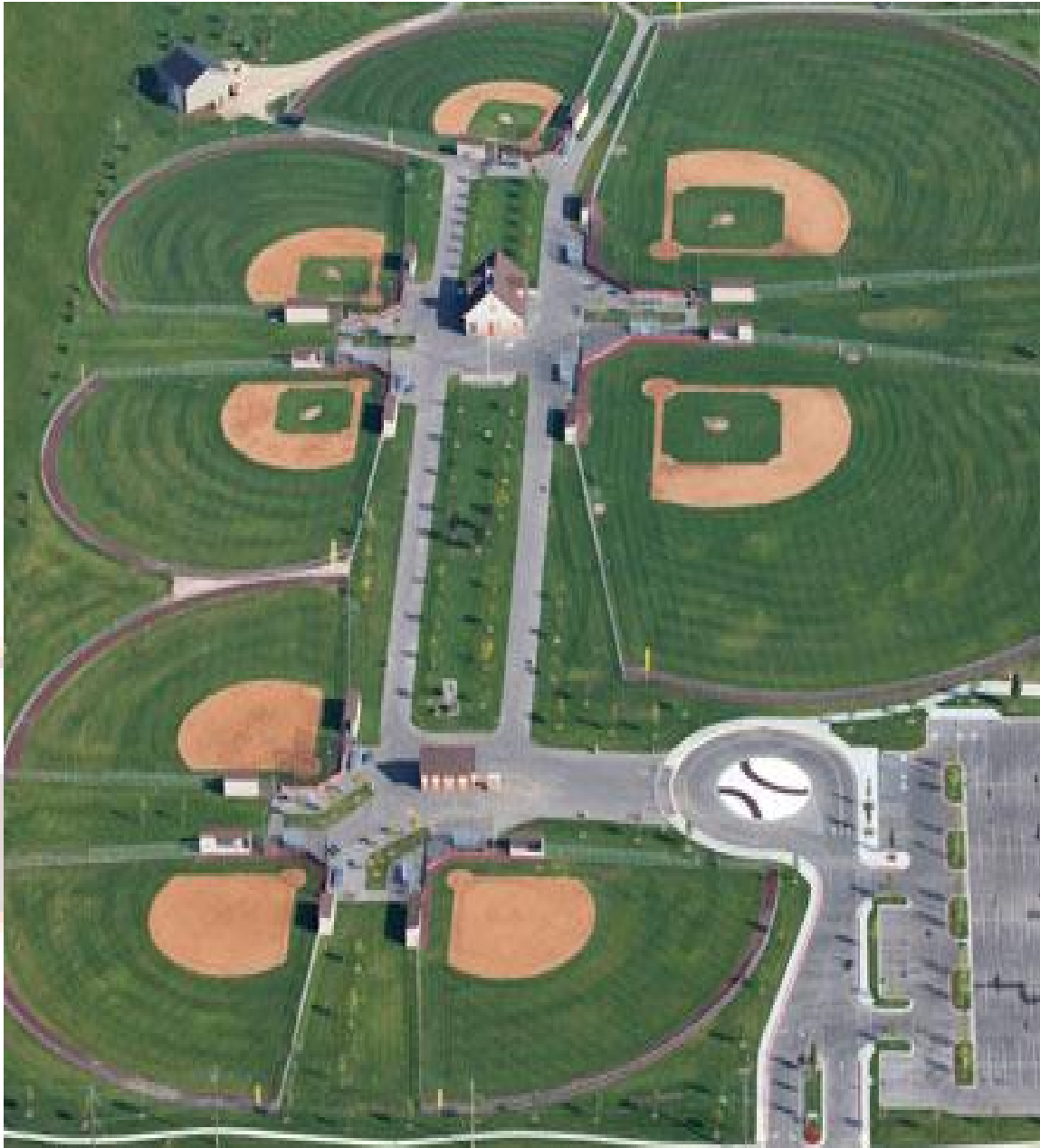
Leighton Family Baseball Complex at Settlers Park

July 17-20, 2019: 9U & 12-70s Meridian, Idaho